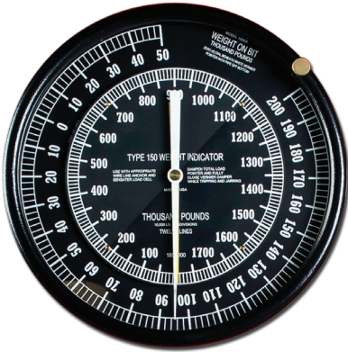
16" Anchor Type Weight Indicator Panel Mount