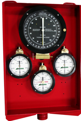
FS Weight Indicator

Matherne Instrumentation's anchor type weight indicator system is designed to give accurate readings of hook load and weight on bit. The system is designed to work with all major deadline anchors using a tension or compression loadcell.