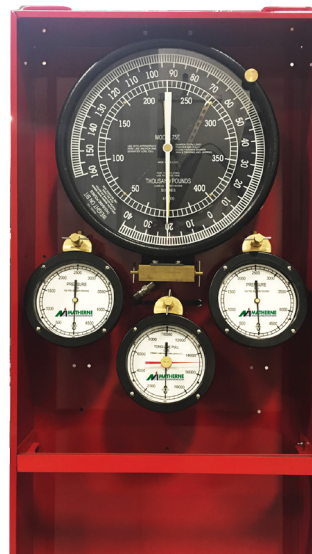
Driller's Box with Anchor Type Weight Indicator