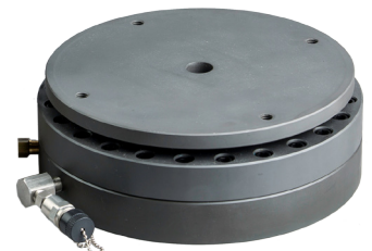
Compression Load Cell