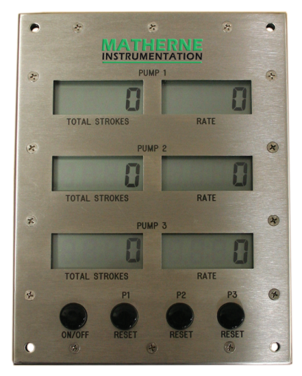
Model PS107 Three-pump Digital Stroke Rate Meter

The Digital Stroke Rate Meter System can be supplied in various configurations depending on customer requirements. Packages can be quoted with or without cables and/or junction boxes, depending on the need for an installation that will be permanent or be broken down for moving from site to site. This system can be combined with other Matherne Instrumentation/Innovative Electronics packages for complete consoles containing both hydraulic and electronic gauges and instruments, including computer systems.