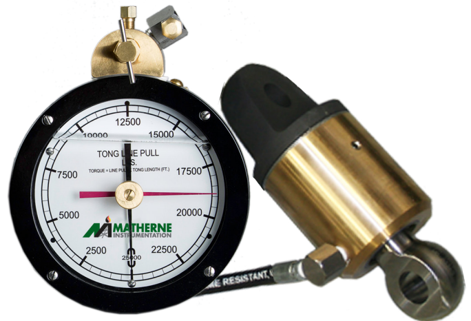
6" Tong Line Pull Gauge Box Mount with hose and Tension Piston Load Cell