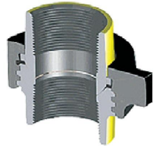
Figure 100 is an economical union with precision machined metal-to-metal sealing surfaces. Recommended for water, oil or gas up to 1,000 PSI NSCWP.